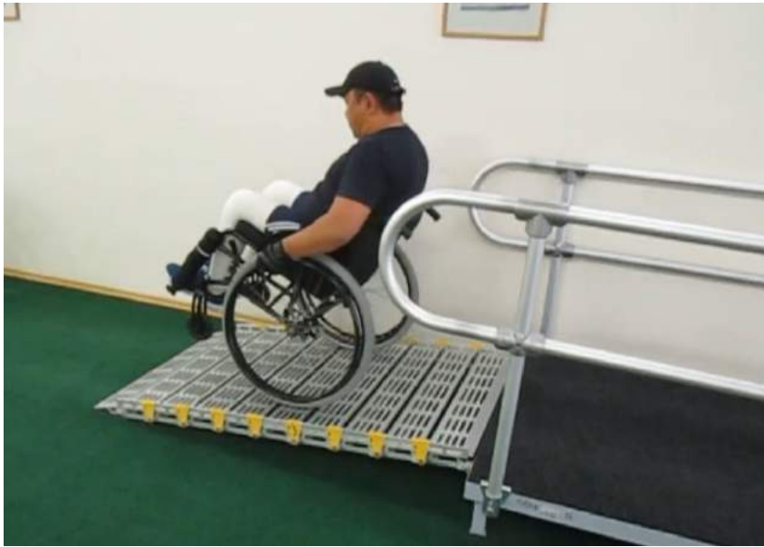
DESCENDS SLIGHT INCLINE AND STOPS