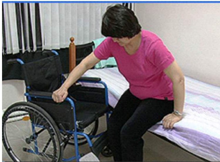
PERFORMS LEVEL TRANSFERS