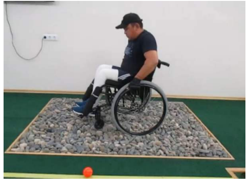
ROLLS ON SOFT SURFACE